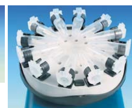
(3) Microtube Platform Head, 0.5~2.0ml Tube “PM310”