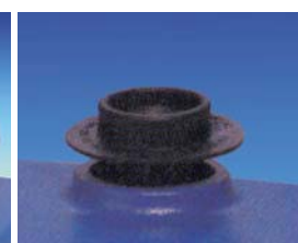
(2) Pop-off Cup Head “PM210”