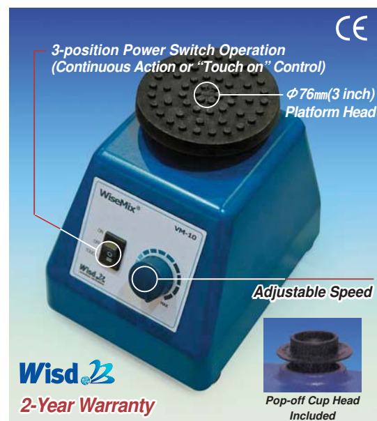
Multifunction Vortex Mixer Set “VM-10” with \phi 76\text{mm} (3”) Platform (PM110)

DH.WVM00310 (3) Microtube Platform Head(0.5~2.0ml), “PM310”