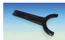
Remove Applicator (Included)