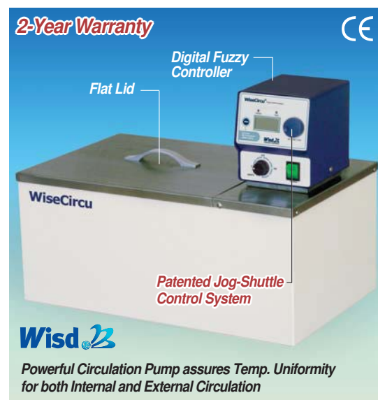
Digital Precise Circulation Water Bath "WCB-22"

DH.WCB30106 Validation Service(IQ, OQ), "CBV106", for "WCB-6" DH.WCB30111 , "CBV111", for "WCB-11" DH.WCB30122 , "CBV122", for "WCB-22"